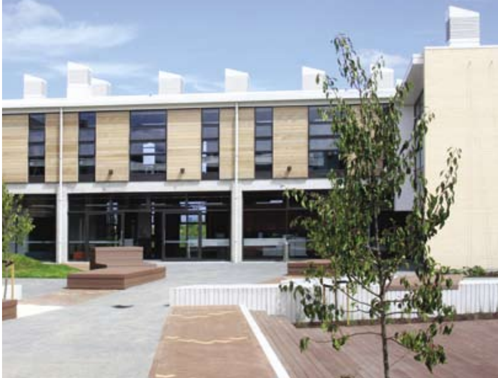
The roof of Ormiston Senior College incorporates 83 Sola-boost Windcatcher units from Monodraught